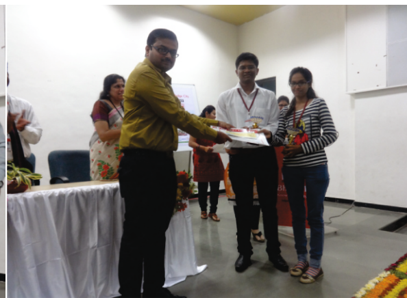
Third Prize Winner Dr. M. S. Gosavi Pharmaceutical Education & Research, Nashik. Student: Cash prize Rs. 2000, Trophy and certificate, Guide: Cash prize Rs. 1000, Trophy and certificate Trophy to Institute