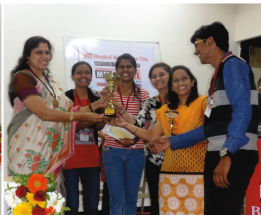
First Prize Winner Dr. M. S. Gosavi Pharmaceutical Education & Research, Nashik. Student: Cash prize Rs. 7000, Trophy and certificate, Guide: Cash prize Rs. 5000, Trophy and certificate Trophy to Institute